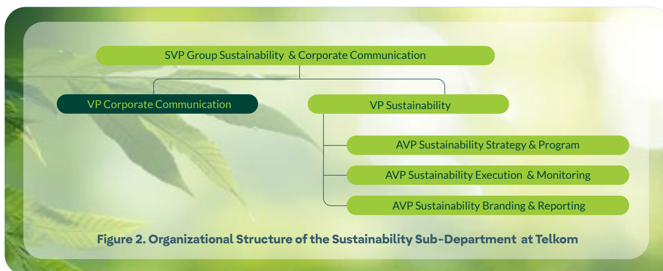
Figure 2. Organizational Structure of the Sustainability Sub-Department at Telkom

Sustainability Management Work Unit, specifically the Sustainability Sub-Department, which is responsible for orchestrating and managing ESG initiatives across the Telkom Group. This includes coordinating ESG strategies and reporting.